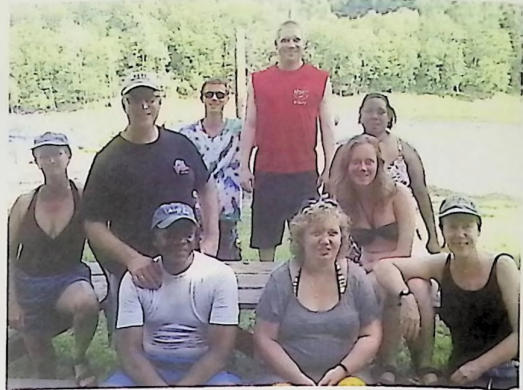
Summer Retreat at Koinonia included a great day of rafting on the Delaware River.