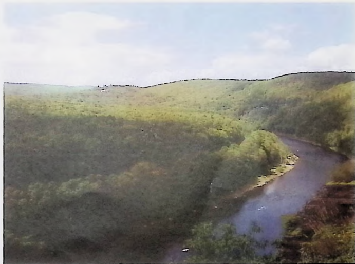
The Delaware River valley near Koinonia. The view from the Hawk's Nest is spectacular. Plan to be part of the Summer Rafting Weekend!

Wednesday Bible Study will begin on Wednesday, Sept. 16, at 6:30 p.m., with the first of a new series entitled: "Love and Faithfulness." We'll explore relationships, the Bible, commitment in our age, marriage, etc. Come and be part of this interesting series.